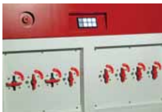
Switches to activate either of the 8 vacuum compartments