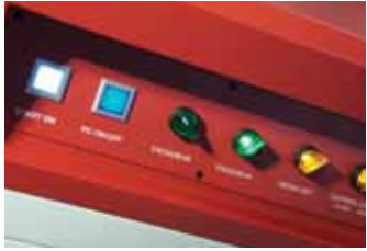
Easy to use operator panel