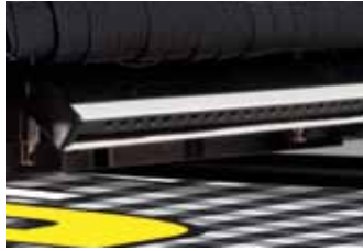
Shuttle safety sensors