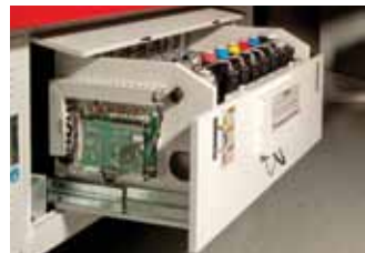
Ink control tray